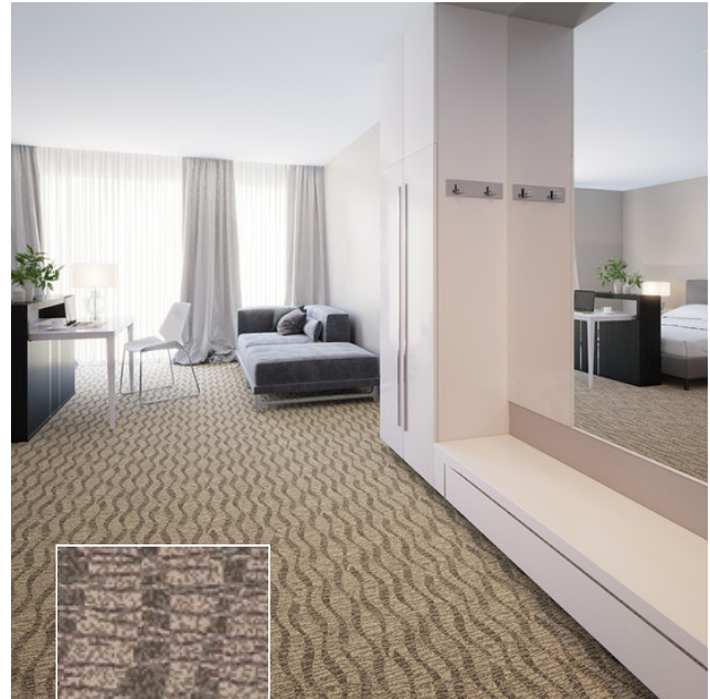
220 / Zen Design Stipple / Acorn